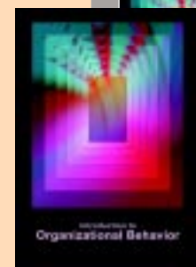
Introduction to Organizational Behavior Paperback: 484 Pages, (Workbook also available)

ICMR ..... HROB 076 ECCH ..... 406-020-1 Organization(s) ..... Valero Countries ..... USA Industry ..... Energy and Utilities Pub/Rev Date ..... 2006 Case Length ..... 14 Pages TN Length ..... N/A